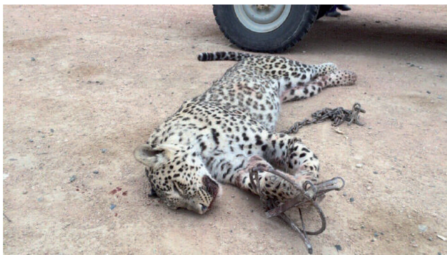
Fig. 1. Illegally trapped and killed Persian leopard in the Karakiyan province, Mangystau region in May 2015, 90 km from the place where Persian leopard was captured in the reserve, source: https://tengrinews.kz/events/stali-izvestnyi-podrobnosti-ubiystva-leoparda-mangystauskoy-274733/

In the evening of 29 September 2018, for close to 120 seconds, from 22:57 h to 22:59 h, the Persian leopard was captured for the first time by a camera trap while