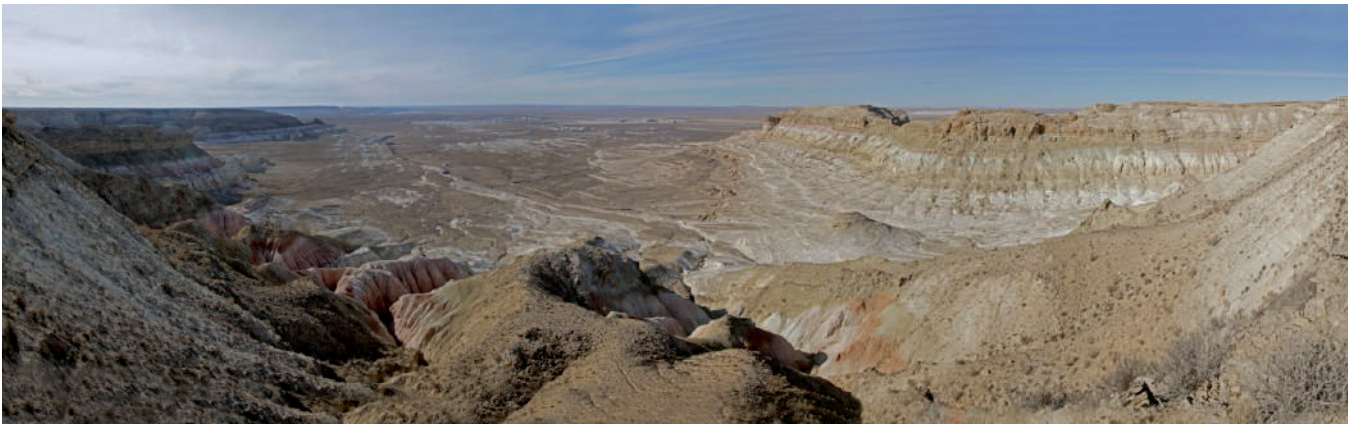
Fig. 2. Habitat of the Persian leopard in the Ustyurt State Nature Reserve (Photo by M. Pestov).

arriving at the bait site, sniffing and then leaving. This camera trap site was located on the rocky edge of the cliff of the Ustyurt Plateau (Fig. 2) and stands at 175 m.