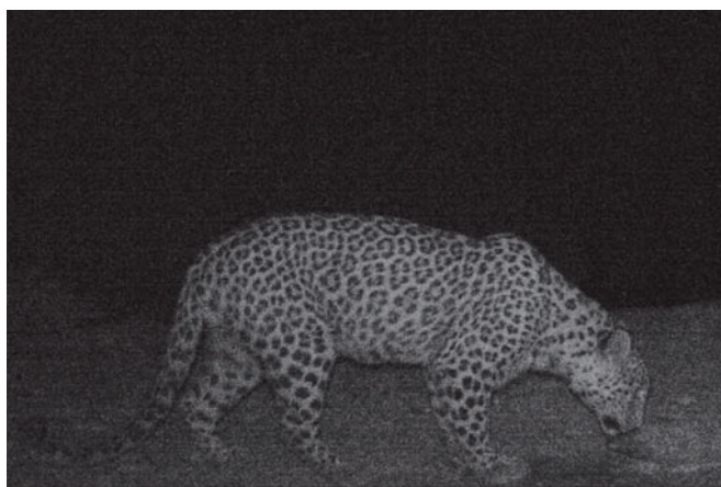
Fig. 3. Camera trap photo of the Persian leopard set up by the authors on the first bait site on the territory of the Ustyurt State Nature Reserve on 6 November 2018.

The appearance of the leopard in Mangystau provides additional arguments in favour for adopting measures to preserve all the biological and landscape diversity of the Ustyurt Plateau. When USNR was established, the scientists' opinion was not fully taken into consideration and because of this, only the Western chink of the Usty-